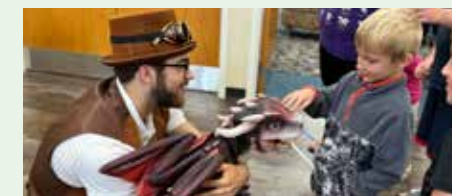
Dragon Training Academy

903 kids registered 4,590 reading log hours 58 programs with 1,760 attending