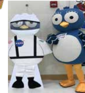
Swoop is ready