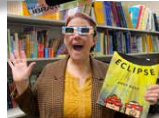
Books and glasses distributed