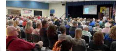
Eclipse programs out in the community

The Eclipse is coming!! Through grants, we were able to do Library programs and reach out into the community with both adult and children programs. There were six different programs leading up to the eclipse that were attended by just over 490 kids and adults.