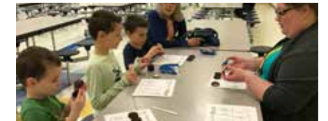
Hands on activities