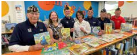
Community organizations donate to support literacy