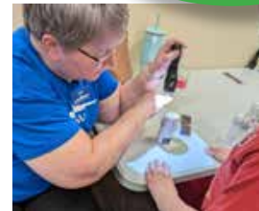
Armstrong Air & Space program