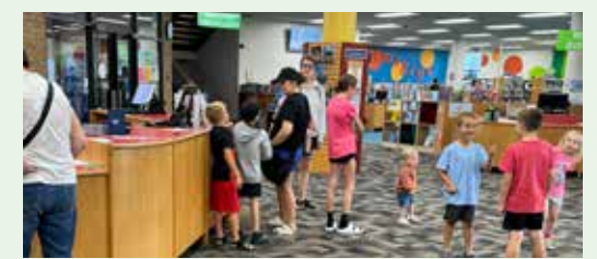
Lining up to register for Summer Reading