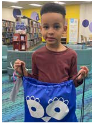
Another graduate of the program