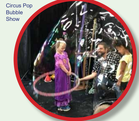
Circus Pop Bubble Show