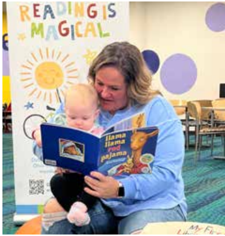
Get children registered early