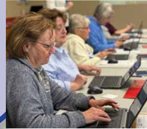
Hands-on classes in small group setting

60+ digital literacy through a grant and partnership with Marion County Council on Aging