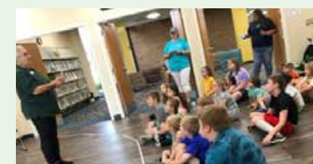
Animals we love to hate