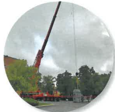
Cranes were brought in for removal and install of the HVAC system.

Branches: Monday & Thursday 2-6 p.m. MPL @ Caledonia – 419-845-3666 112 East Marion Street, Caledonia, OH 43314 MPL @ LaRue – 740-499-3066 86 South High Street, LaRue, OH 43332 MPL @ Prospect – 740-494-2684 116 North Main Street, Prospect, OH 43342