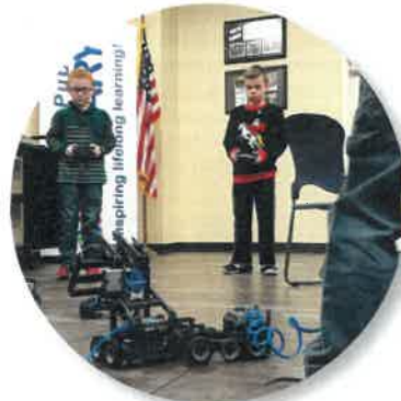
Tri-Rivers RAMTEC Robotics Programs and Summer Camps