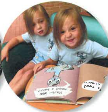
My First Library Card ongoing support from Marion Community Foundation, Marion Noon Kiwanis and Marion Rotary