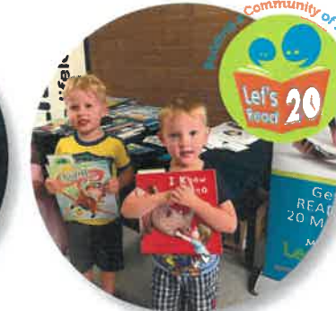
Let's Read 20 at School Literacy Nights