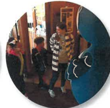
Marion Palace Theatre Dragons Love Tacos School Program