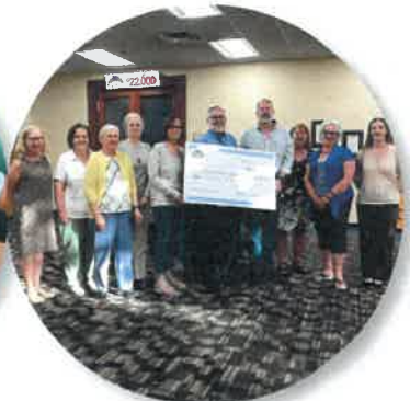
BookMarks of Marion Public Library donations now total $29,000.

Special Thanks: to all of the organizations that partnered with the Library to add to and improve our services. These and many more partners helped to create a better Marion Public Library in 2018. We look forward to growing these partnerships as they allow the Library to provide so many new and innovative services that greatly impact our patrons. Thanks again!