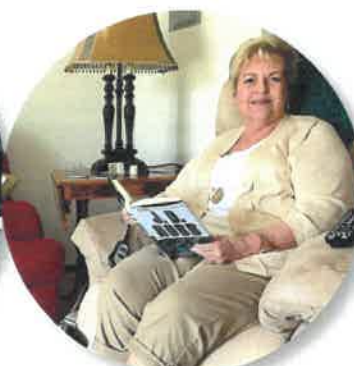
Marion Council on Aging Grant for Large Print/Audio book collections