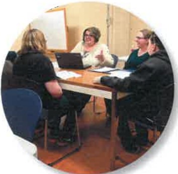
Marion Technical College Aspire classes met in the Library