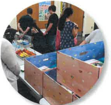
Marion Public Health Celebraty Baby Fair with Safe Sleeping Baby Boxes

Special Thanks: to all of the organizations that partnered with the Library to add to and improve our services. These and many more partners helped to create a better Marion Public Library in 2018. We look forward to growing these partnerships as they allow the Library to provide so many new and innovative services that greatly impact our patrons. Thanks again!